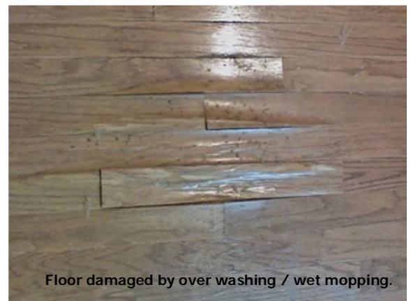
Floor damaged by over washing / wet mopping.